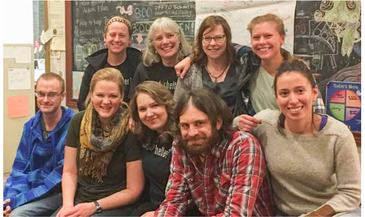
Some of the FYA team

Facilitating life transitions for at-risk youth