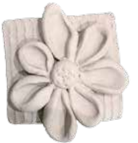
Art projects at The Door